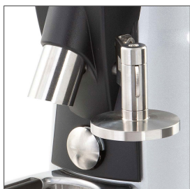
Stainless steel tamper

Stainless steel tamper Filter-holder support